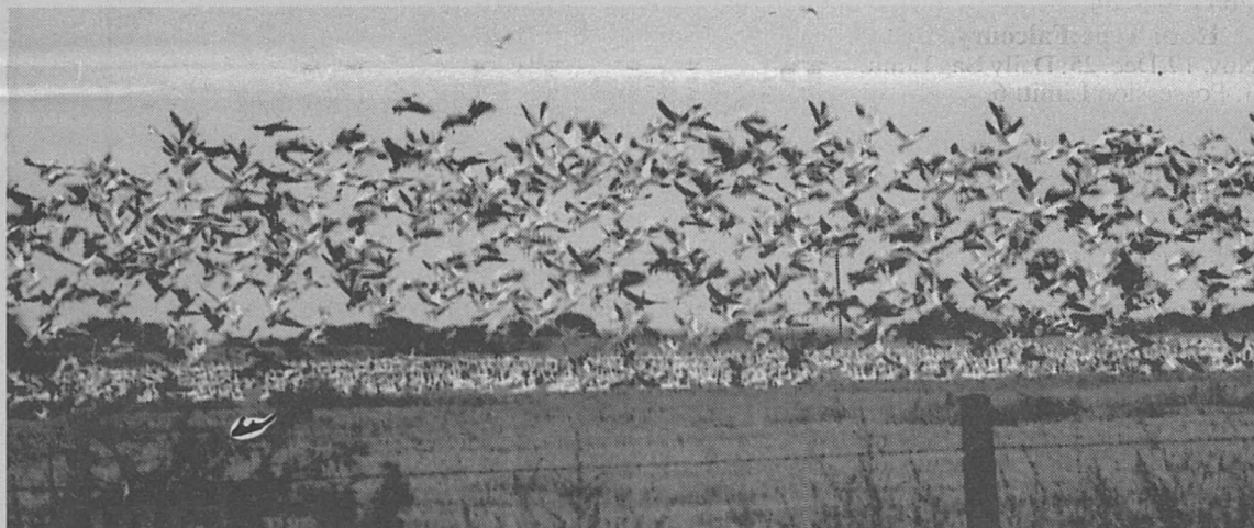
This photo, taken just outside Eagle Lake, will give hunters an idea of what they could find (large numbers and a wide variety of birds) when they hit the praries with their guide.

20 Calhoun Road (Hwy. 90-A East) 234-3984